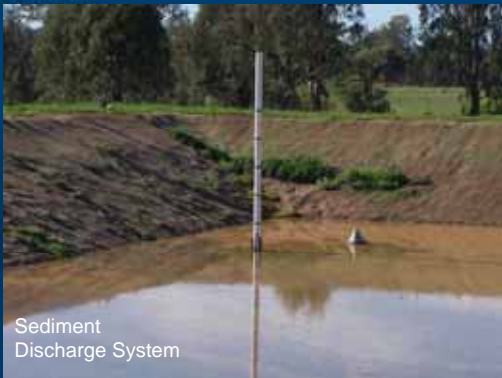
Sediment Discharge System